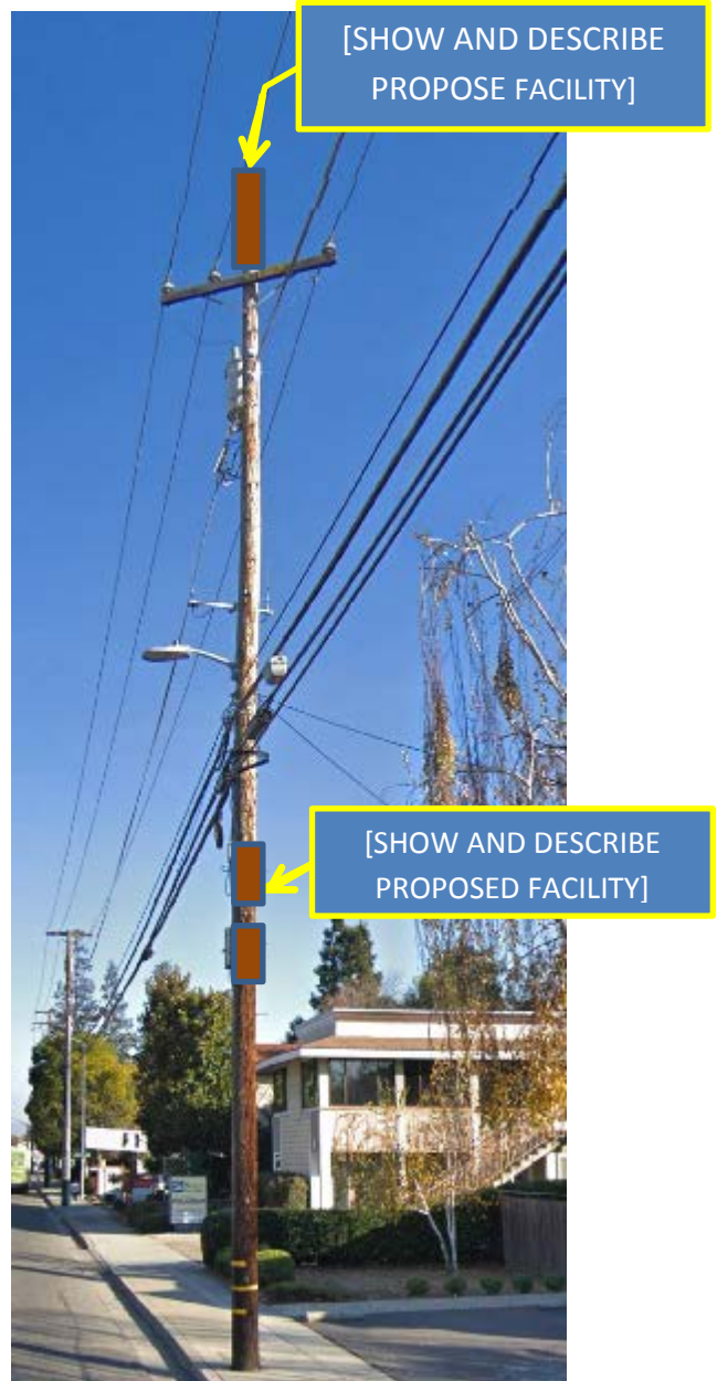
PROPOSED [Provide photo of existing with artistic rendering of proposed equipment, equipment labels, and title, e.g., PROPOSED W. CAMPBELL AVE. NEAR JEFFERS WAY. Rendering to illustrate the size of the facility proportional to its surroundings, but is not shown in this example.]