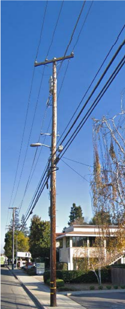
EXISTING [Provide photo of existing including nearby area and title, e.g., EXISTING W. CAMPBELL AVE NEAR JEFFERS WAY]