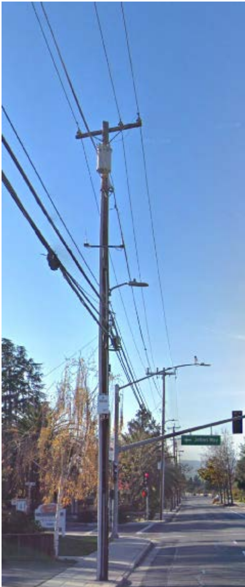
EXISTING [Provide photo of existing including nearby area and title]